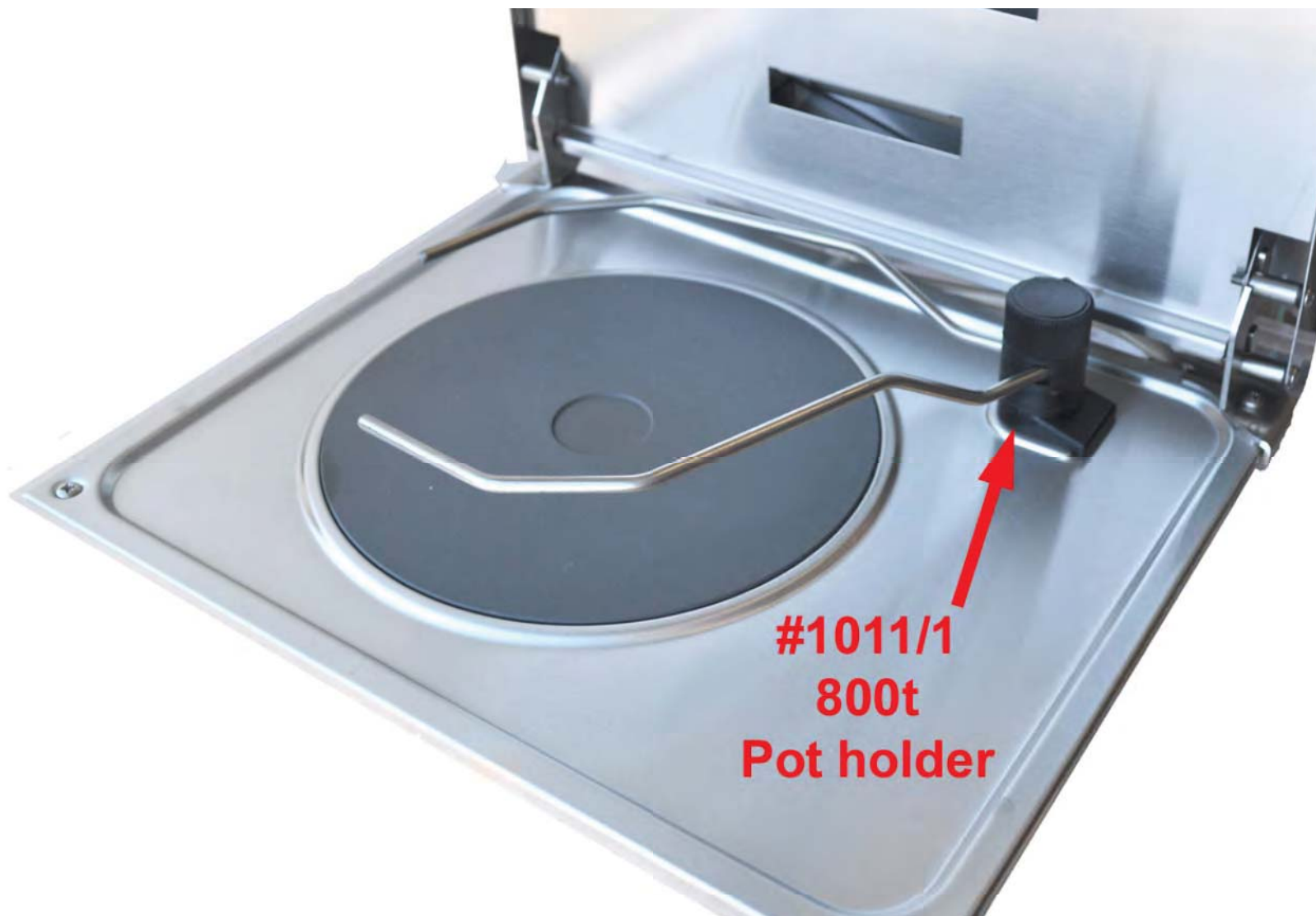
#1011/1 800t Pot holder